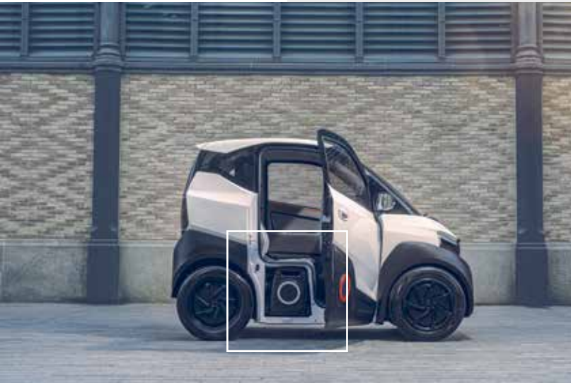
2 x Battery packs. One on each side, below each seat