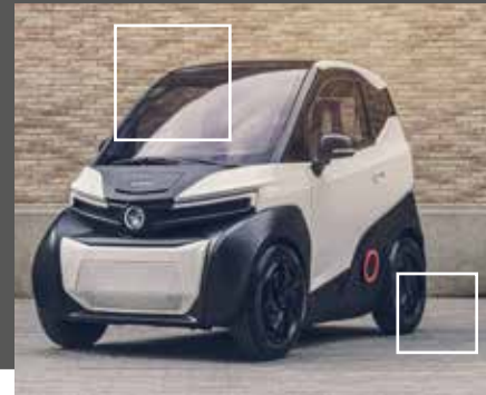
Wide visibility and brightness 5-speed windshield wiper Rear wheel drive tyres 155/65 r14