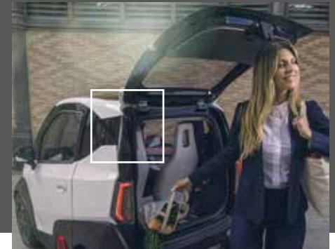
Boot with a 310 L capacity 85x75 cm